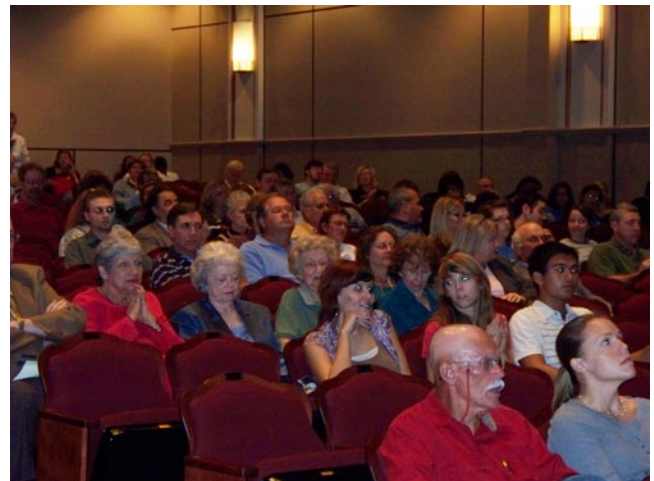
Premier Night Crowd Awaits Film