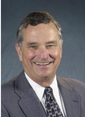
Hodding Carter, III