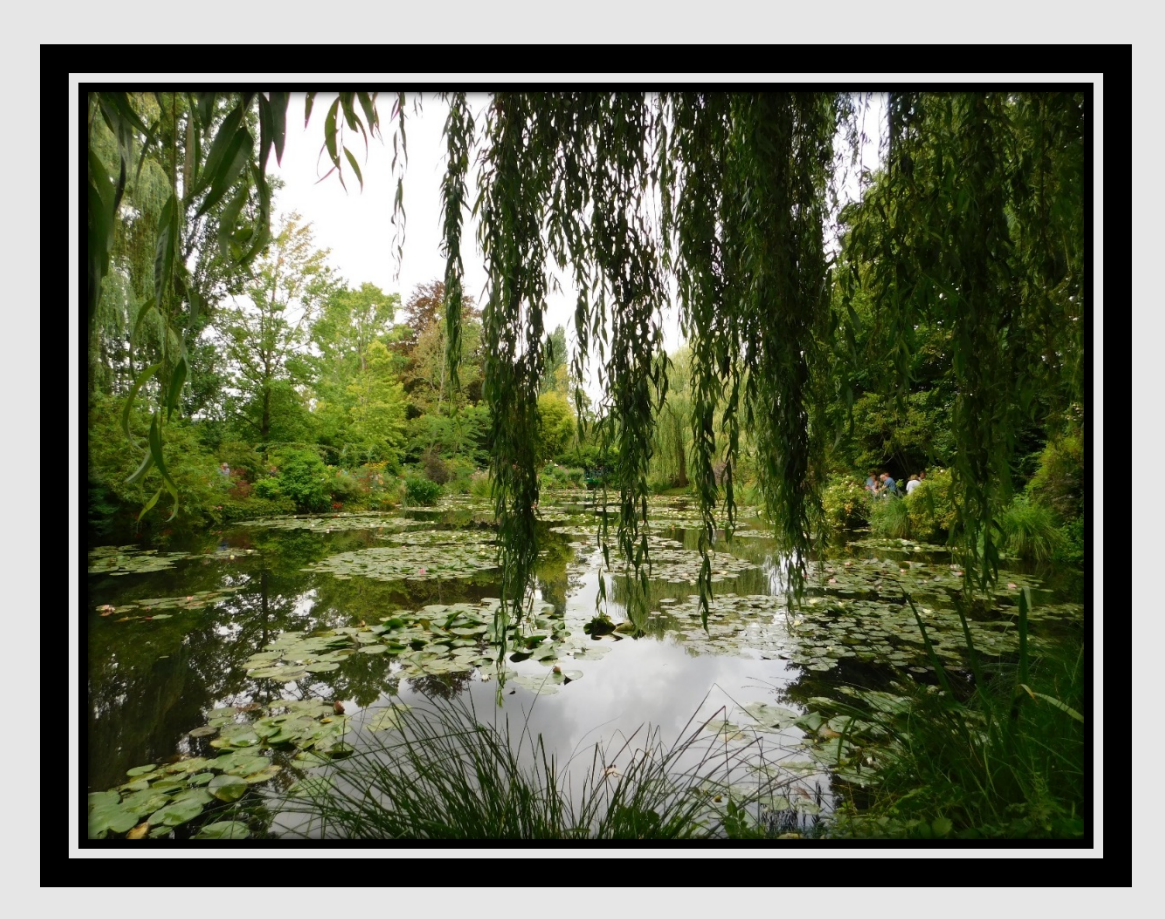
(Biology in France Program)