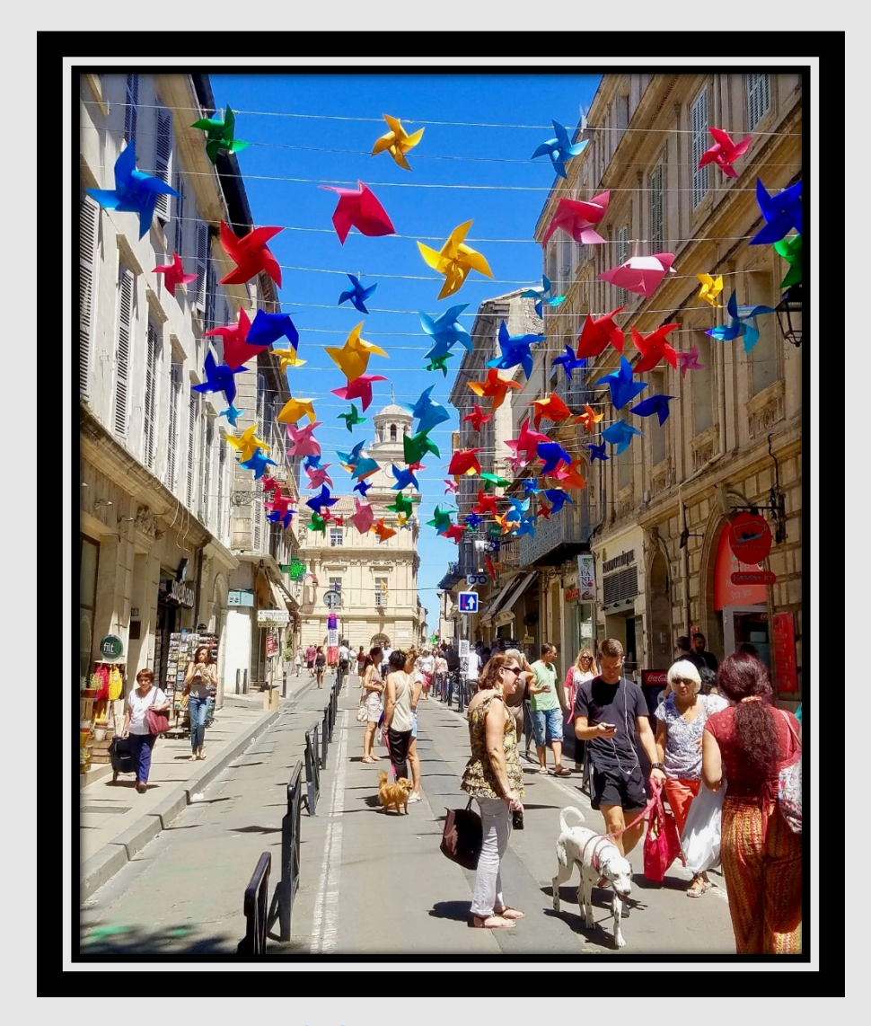
(Language & Culture in France Program)