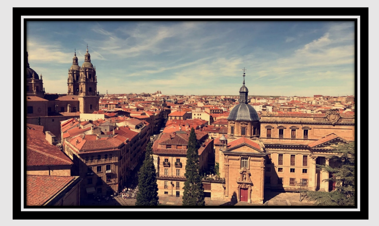
(Business in Europe Program)