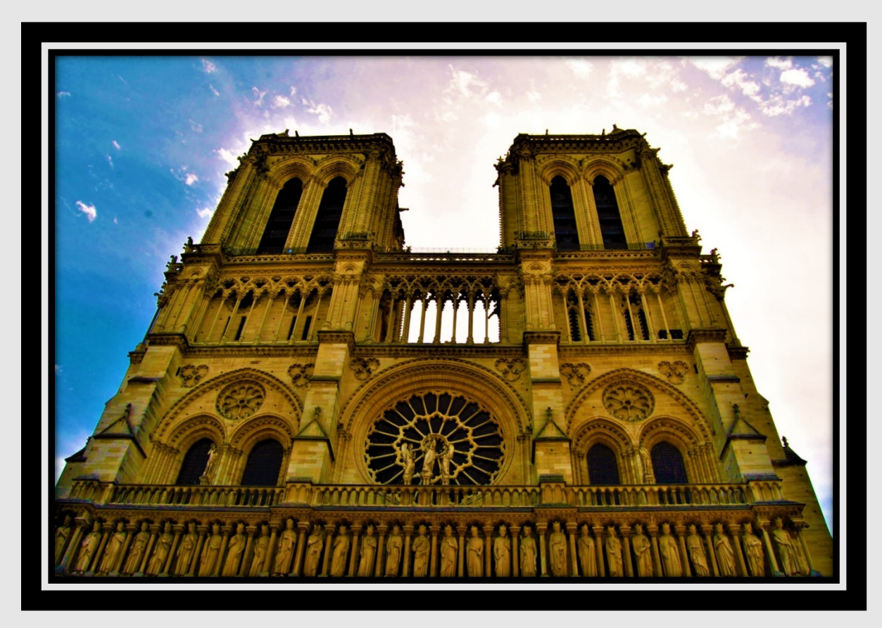
(Biology in France Program)