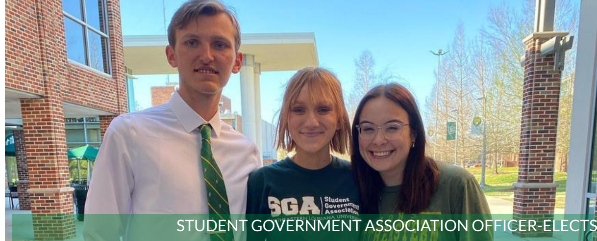
STUDENT GOVERNMENT ASSOCIATION OFFICER-ELECTS